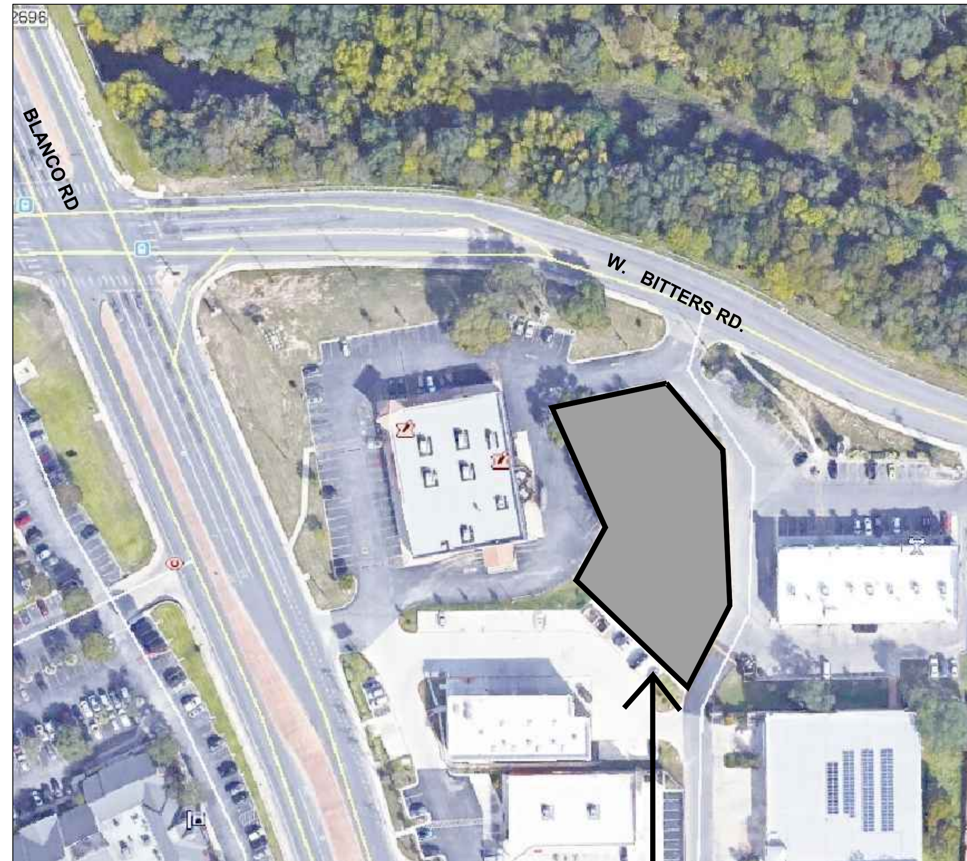
BUSH'S CHICKEN LOCATION